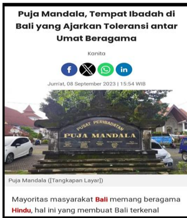
Figure 2. Puja Mandala

The image above shows one of Bali's local wisdom-based sites, the Puja Mandala. It is a worship center housing five houses of worship within a single complex. It is located in Kampial Village, Benoa Village, South Kuta District, Badung Regency, Bali. It is a center of worship for five religions: Islam, Protestantism, Catholicism, Buddhism, and Hinduism. Puja Mandala demonstrates the beauty of Bali's tolerance for Indonesia, as it serves as a place of worship.