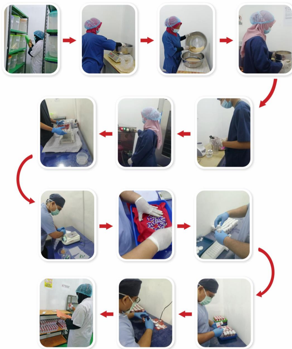
Figure 4. Photo of the production process at PT Autoimmune Care Indonesia Cirebon West Java Indonesia

Other waste produced is dust, dirt from raw materials, and herbal powder blown by the wind. For this reason, the sieving section has been equipped with an air filter bag so that it can reduce dust pollution. For dust outside the grinding part is cleaned with a vacuum cleaner