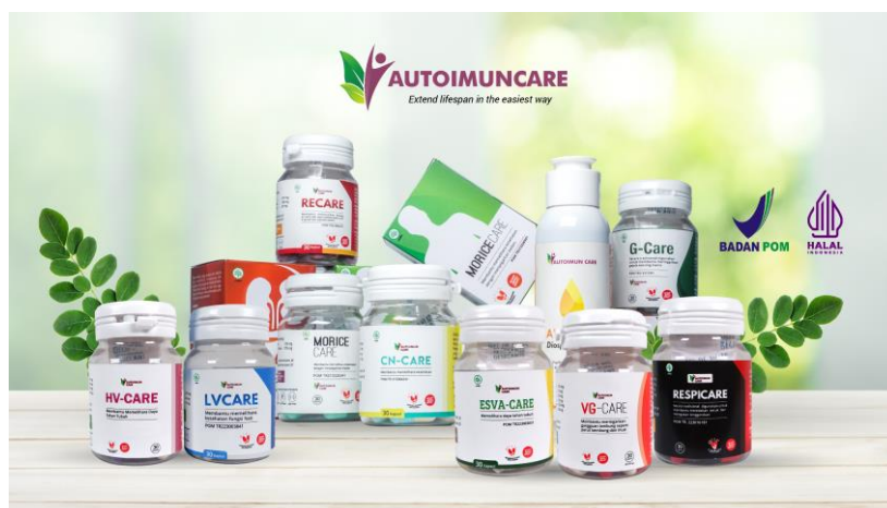
Figure 3. Autoimuncare Product