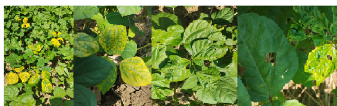
Figure 2. Weather and Nutrient Deficiencies in Soybean Plants

In the case of soybean cultivation in the production center based on the preliminary survey, the environmental conditions exhibit specific characteristics, with daily rainfall varying between 239.7 mm to 647.3 mm per month, averaging 9 to 26 rainy days per month. The pattern of rainfall during the experiment can influence plant growth and response to the given interaction treatments. The average minimum temperature ranges from 23.7°C to 24.1°C, while the monthly average maximum temperature ranges from 30.6°C to 32.5°C. The average humidity during the experiment ranges from 87% to 90%.