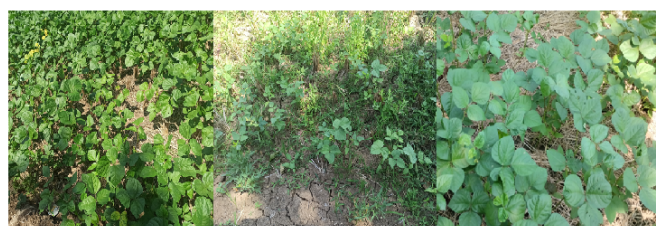
Figure 3. Growth Of Soybean Plants Without Direct Sunlight