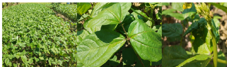
Figure 4. Growth Of Soybean Plants With Direct Sunlight.